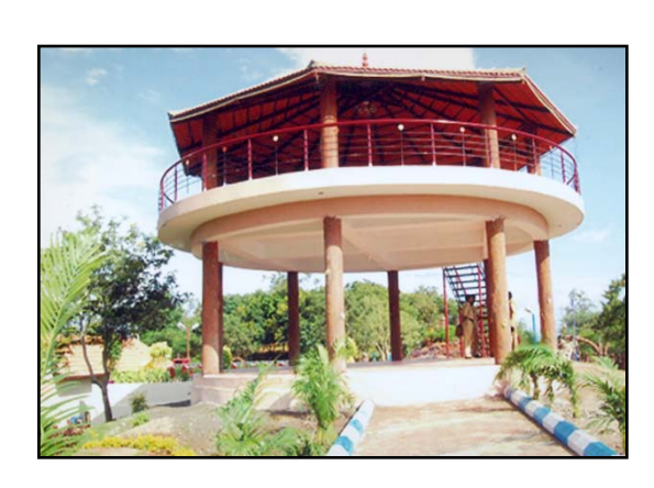
Gazebo – 1, GF + FF.