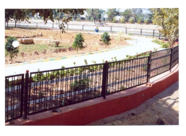
Foot path & railings