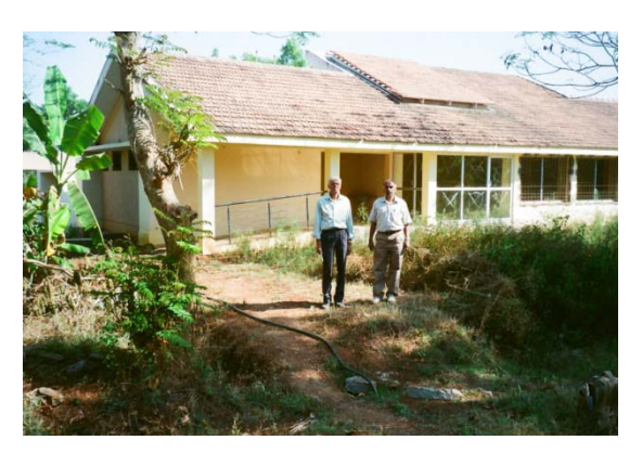
Yatranivas at Uduthadi Shikaripura taluk