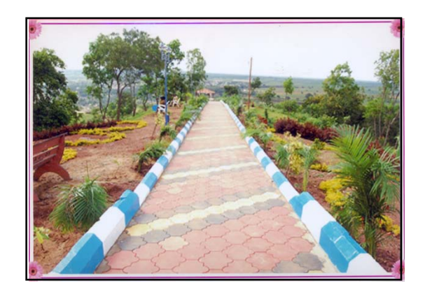
Paves and Kerb Stones for Pathway,