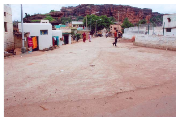
Renovation of Earthern road between Dr. Ambedkar Statue to caves also existing concreting road improvement