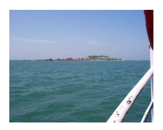
Panaromic view of Malpe Beach