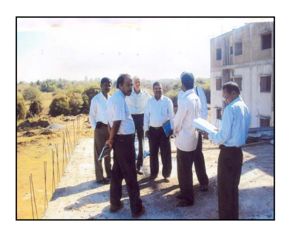
Construction of Jain Yatri Nivas