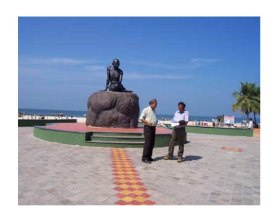
Circle & Mahatma Gandhi Statue