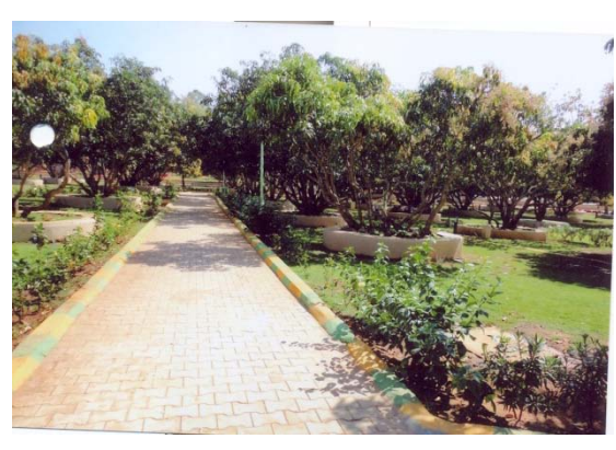
Foot path – Benches under Mango Trees