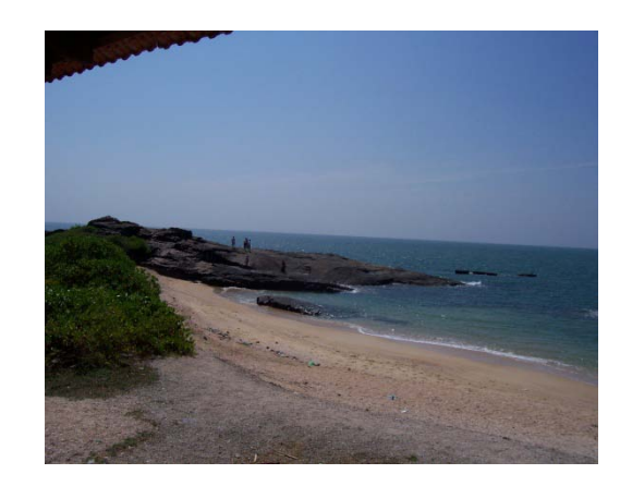
Panaromic view of Malpe Beach & Arabian sea