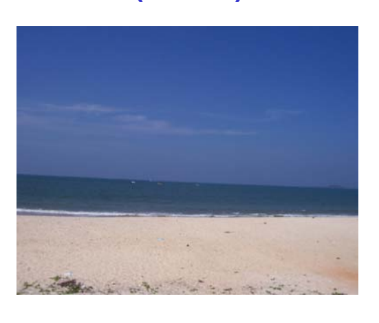
View of Arabian sea – Malpe beach