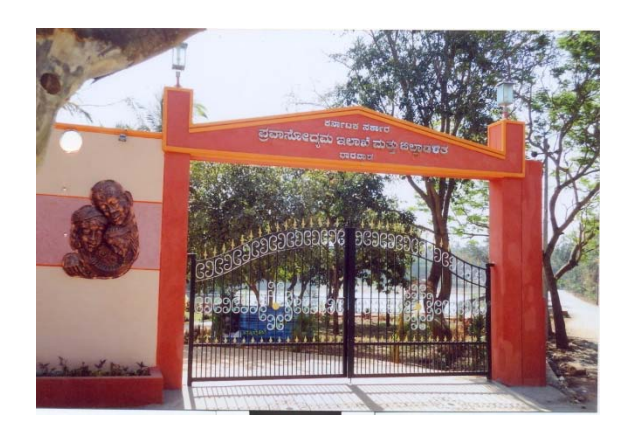
Entrance Gate – (Entry Arch)