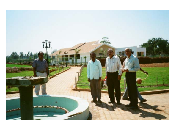
View of Yatri nivas – at background Shikaripura