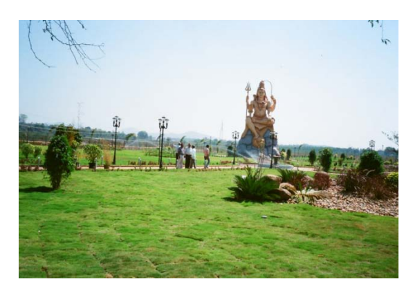
Shiva Statue & park in the upstream of Huchharayanakere - Shikaripura