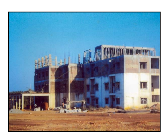
Construction of Jain Yatri Nivas