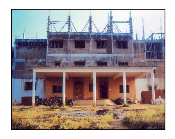
Construction of Jain Yatri Nivas