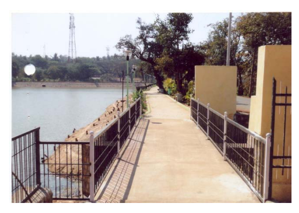
Tank Development including desilting, stone pitching and Island creation.