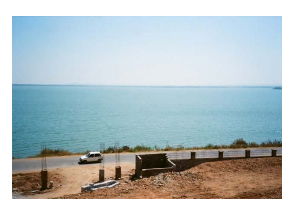
Panaromic view of Santhisagara large lake in front of Yatrinivas