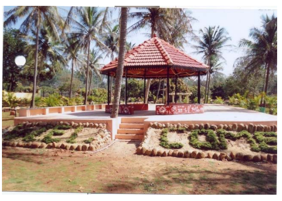
Gazebo – tiled Benches under Coconut trees