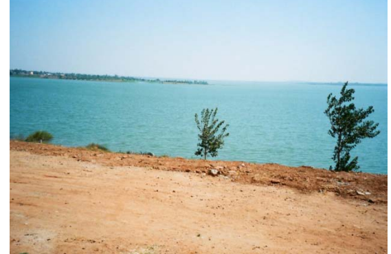
View of Yatrinivas at Sulikere Channagiri Taluk